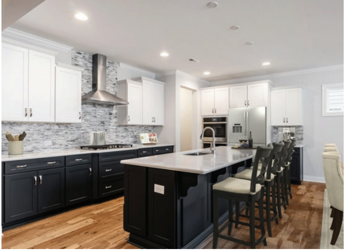
KITCHEN WITH SPLIT COOKING OPTION